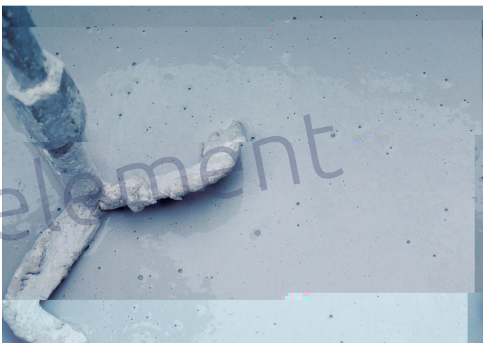
Let rest 1 min so that air bubbles rise, then mix again for 30 seconds.