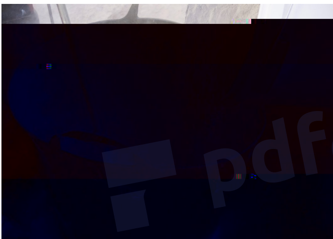
Pour the powder of the smooth concrete and mix for 2 to 3 minutes maximum at medium speed.