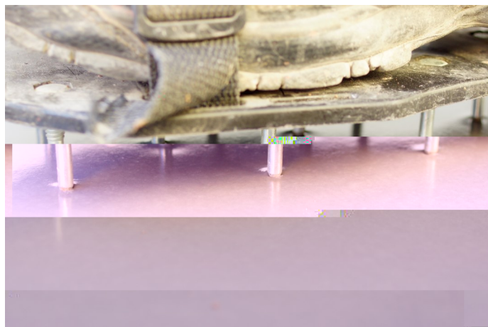
Use nail shoes to move in smooth concrete when needed.