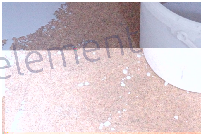
Beware of drips. Provide a bucket to put the Flemish in and avoid the drips on the ground.