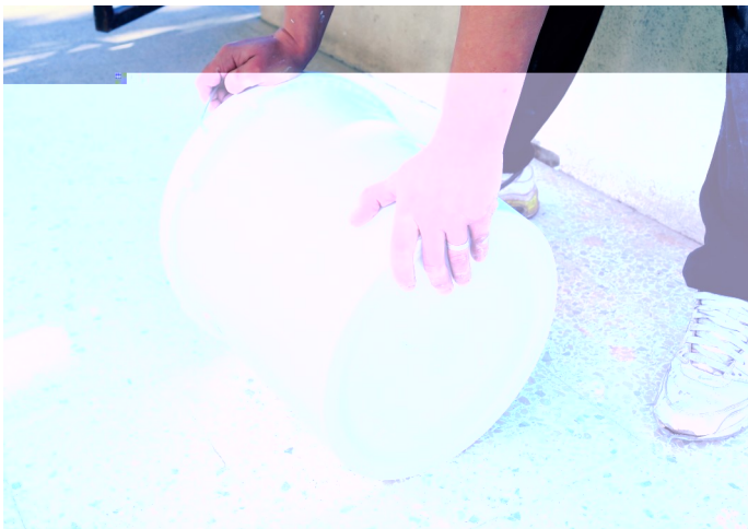
Roll the bucket of waxed concrete before opening it to decompact it..