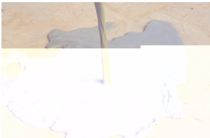
Pour the wheat on the ground in a regular and uniform way.

Casting and implementation smooth concrete.