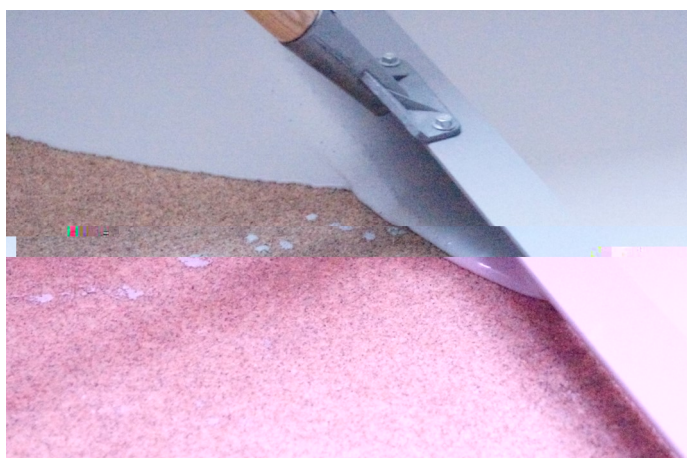
Pull the concrete smooth with the ruler so that it has the same thickness everywhere.