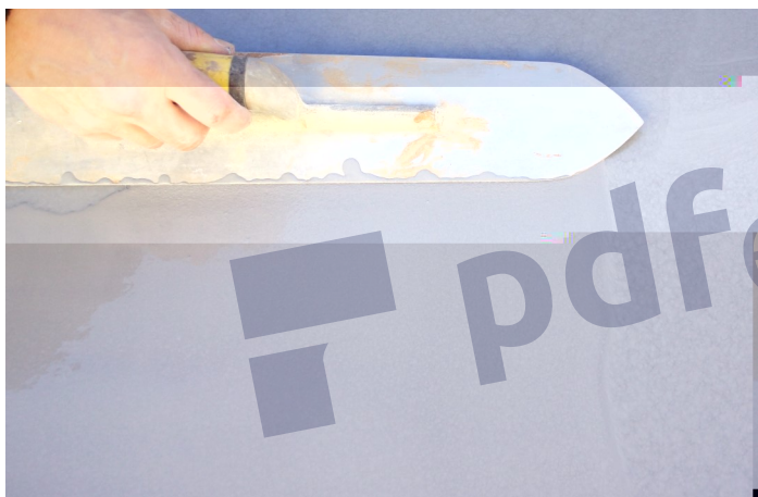
Help yourself with the Flemish to put up against the walls