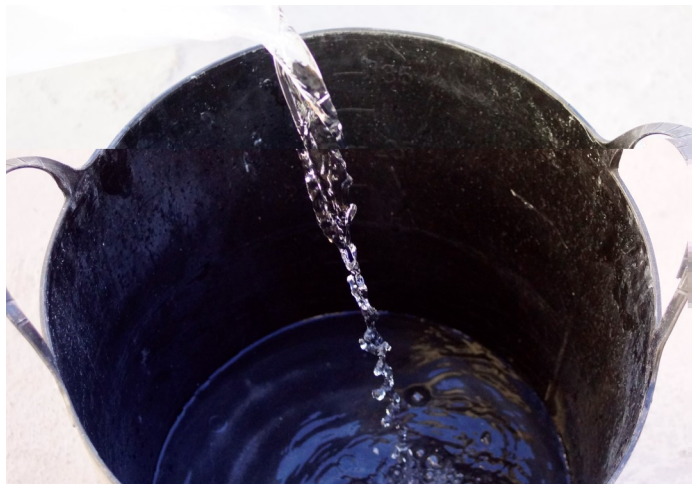
Pour 6 l to 6.2 l of water in the 40 L bucket