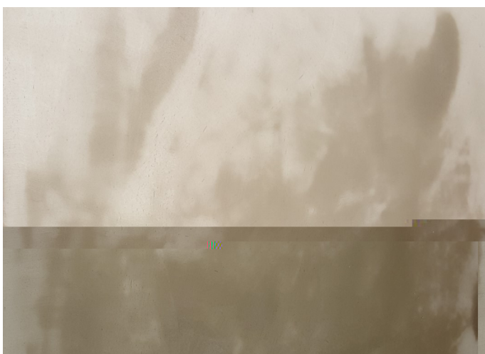
Let it dry for at least 4 hours and more depending on the ambient temperature.