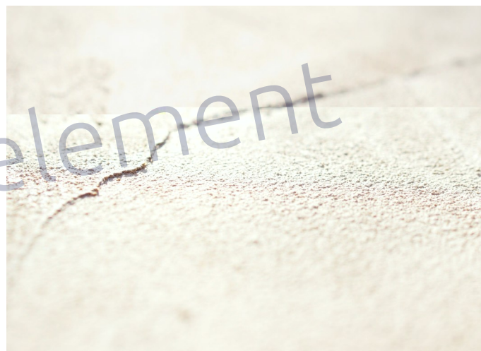
These defects of application will have to be removed thanks to the use of the sponge.