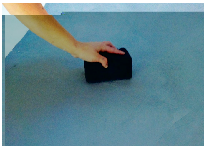
As and when the application of the waxed concrete progresses, pass a sponge of cement to remove any sardines.