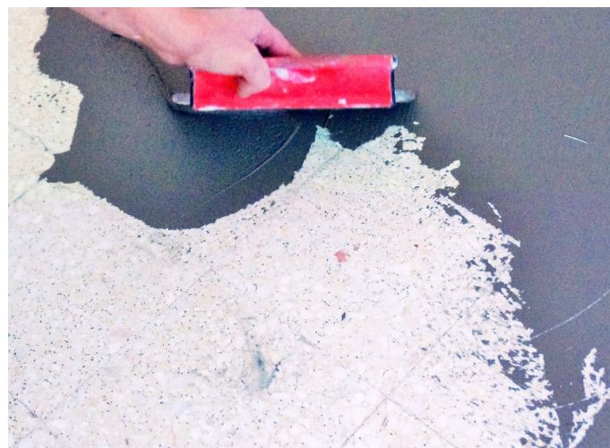
Look for a regular application and with little mark.