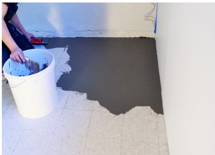
Apply as and when the cement glue on the surface.