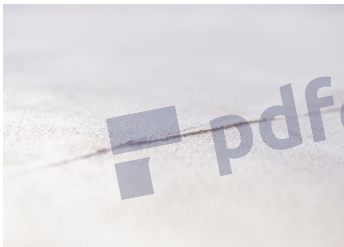
Examples of application defects or smoother mark (also called sardine).