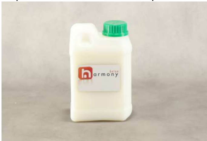
Harmony wax is an acrylic wax.

Implementation of the wax. Only on wall.