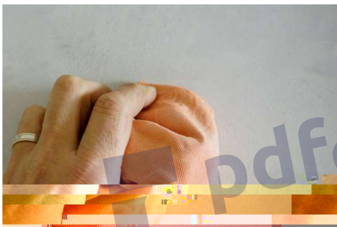
Wipe the excess wax with a soft cloth in order to remove any traces of application of the wax.