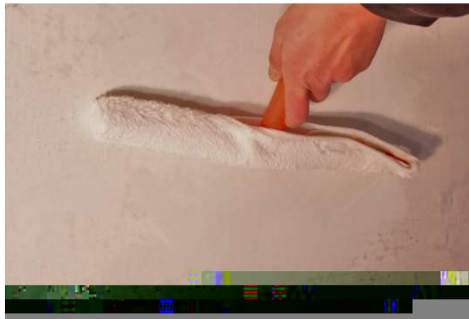
Apply the wax with a cloth or a wet broom Work from the bottom to the top